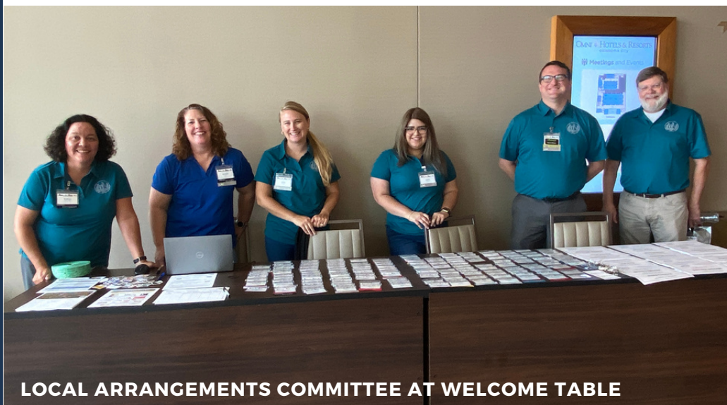
LOCAL ARRANGEMENTS COMMITTEE AT WELCOME TABLE

Attendees embraced the "Catching on to Transportation Trends" theme of the meeting by utilizing various modes of transportation: streetcars, cars, buses, bikes, scooters, and walking to get around Oklahoma City.